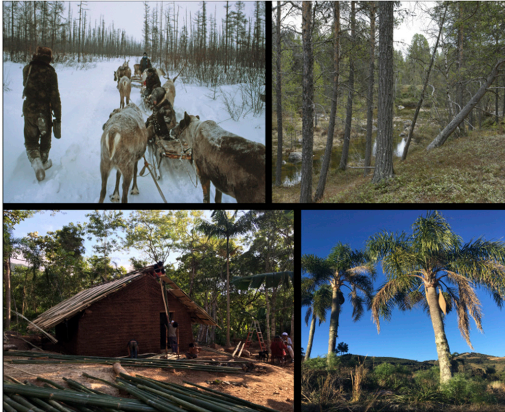
Indigenous and traditional cultures and languages are the backbone of biodiversity conservation across the globe. Nonetheless, the rich knowledge found in these languages and cultures is not used in standard monitoring or conservation projects, and they face constant perils from parts of society with economic and political power. (Top Left) Evenki reindeer herders, Russia. (Top Right) Skolt Saami old growth forests Finland. (Bottom) Guarani community and local ecosystem vegetation, Brazil.

species present in the Kawawana ICCA are considered as sought-after commodities and are used in traditional ceremonies.